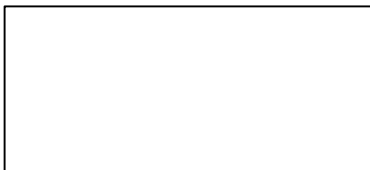
MOUNT LOCATION PLAN VIEW